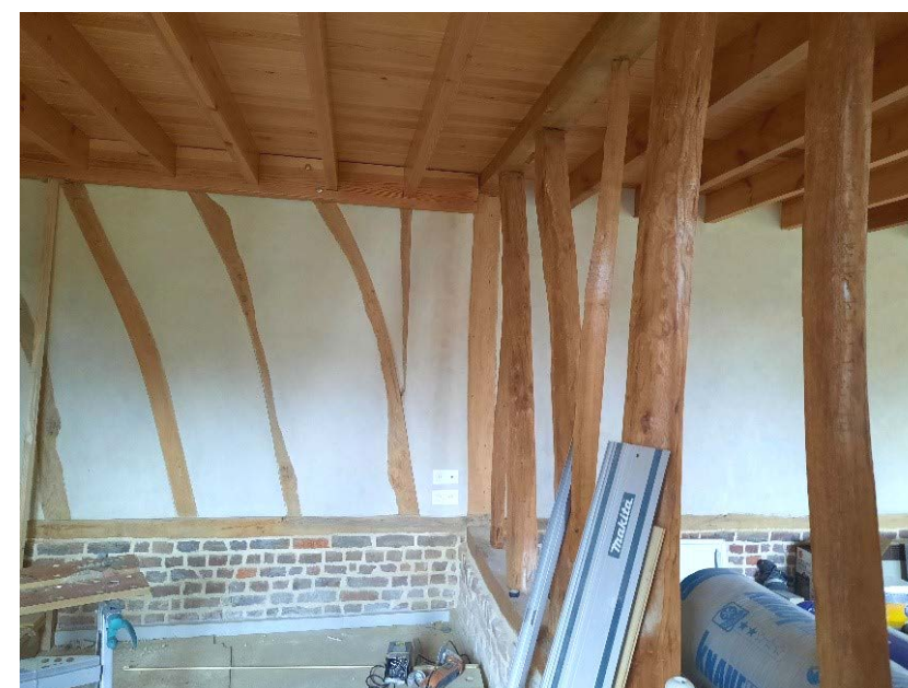
Inside, the dwarf wall is made of brick, with a stringer on top supporting the wooden frame.