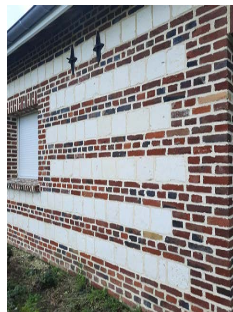
A rouge-barre wall at the back of this cob-built house has been renovated: this brick-laying technique alternates a row of stone with three rows of brick.

If you now turn to the other side of the street, you will notice that most of the houses are perpendicular to the road . Just a builder's whim? Not at all! This configuration provides a better shield from the wind and follows the slope of the road. All the windows are south facing which leaves the north wall bare of windows but makes best use of natural sunlight. The cob used to insulate the walls is made of clay earth , which was readily available, and straw . This composite material is used to fill in the spaces of a wooden frame and is protected from rain and mould by a lime wash . It provides optimal insulation of the building.