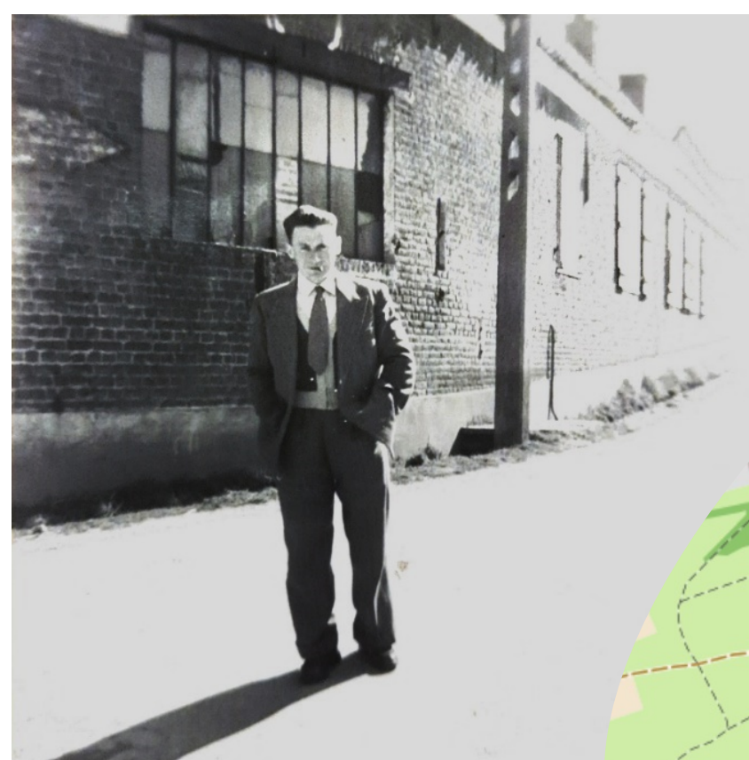
A local man posing for a photograph in front of the forge and the workshop window.