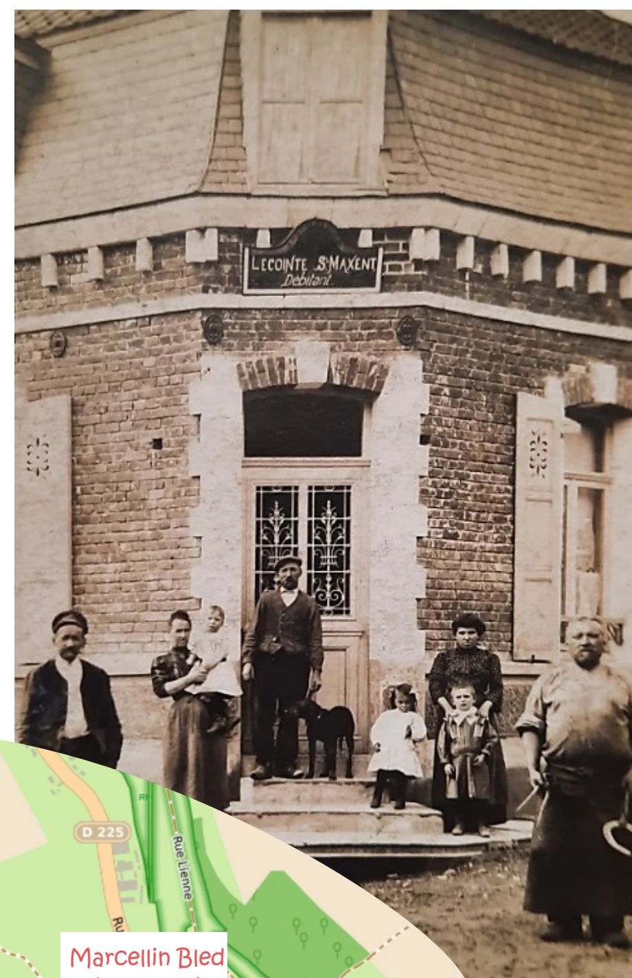
The corner shop when it was still a café, around 1910. At the bottom left, we can see the blacksmith posing with his tools (postcard,).