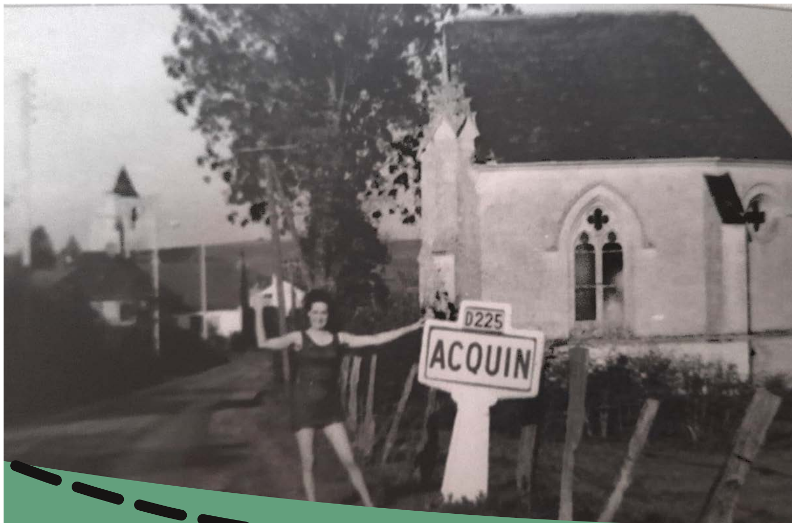
Friend of the photographer Marcel Guilbaut (from Lambersart), posing beside the road sign at the entrance to the village, 1950-60s. We can see the chapel and the church in the background (postcard).

As many as 105 chapels were built in the diocese of Arras from 1864 to 1873 , demonstrating how devout these country people were. The chapel was part of a newly revived religious fervour ; along with oratories and calvaries, they were the stations that marked religious procession routes. Like many other chapels at the end of the 19th century, it is dedicated to the Sacred Heart of Jesus, a plaster statue of whom stands above the altar. These shrines were sometimes built in times of war, epidemic or famine; they were also a symbol of gratitude for divine protection, or built as a memorial to the victims of those hard times, like the cholera epidemic which scourged the region from 1853 to 1856. The chapel was designated a place of worship on 5 August 1888 and was even used for the local children's catechism lessons . Thanks to the town council and the Fondation du patrimoine , the chapel was restored in 1990. This emblematic building at the entrance to the village shows off the local chalky stone to perfection.