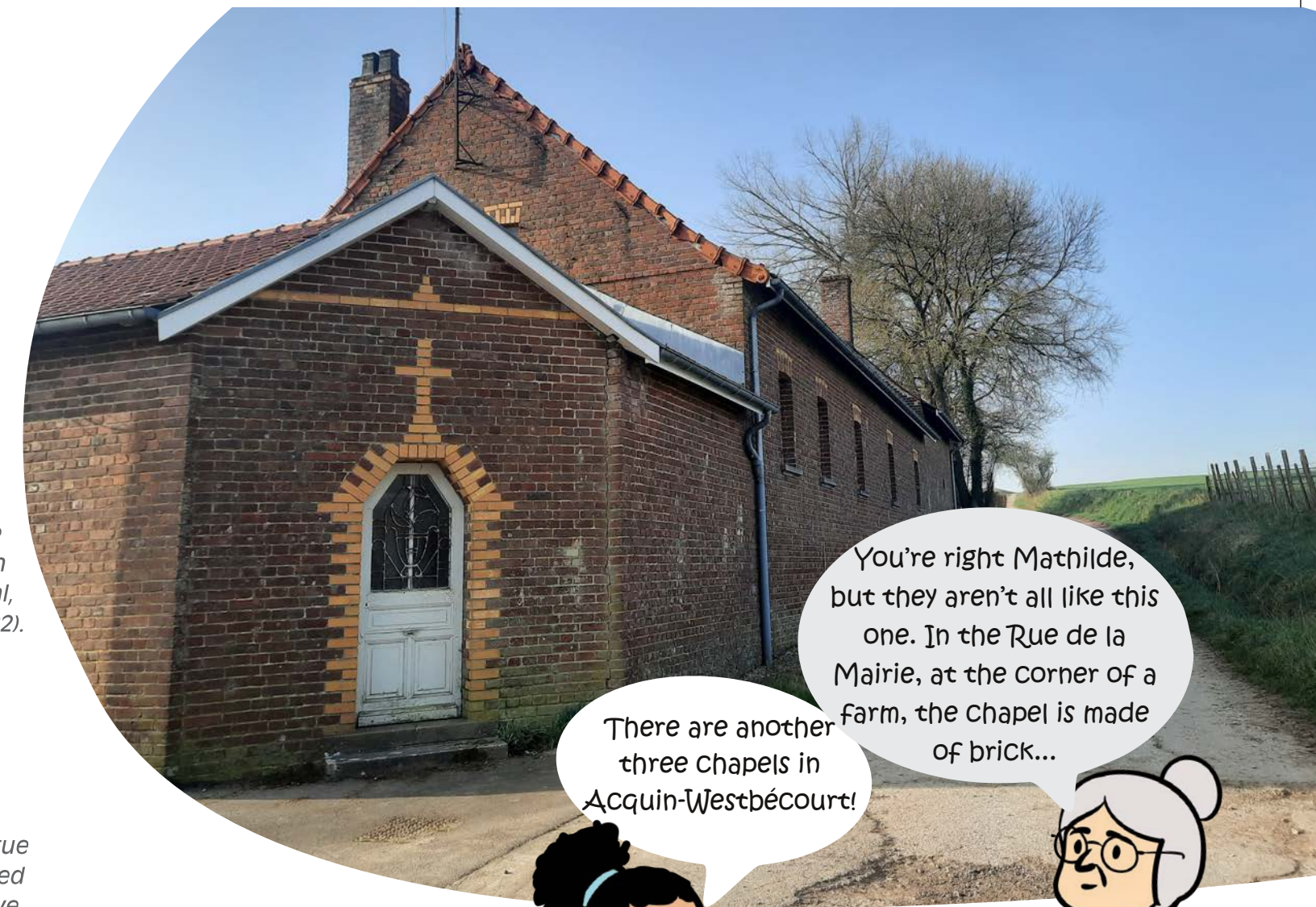
Chapel in the Rue de la Mairie.