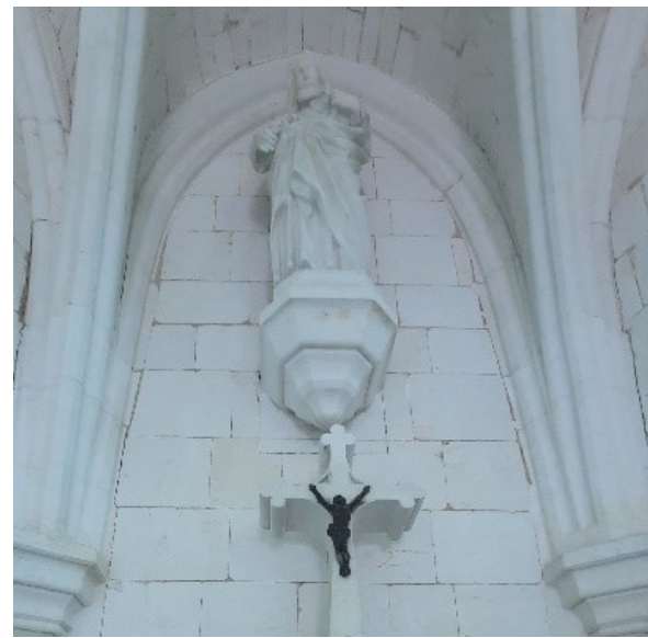
Plaster statue of the Sacred Heart, above the altar of the chapel (photograph by Mathilde Duval, coll. CHHP 2021).

As many as 105 chapels were built in the diocese of Arras from 1864 to 1873 , demonstrating how devout these country people were. The chapel was part of a newly revived religious fervour ; along with oratories and calvaries, they were the stations that marked religious procession routes. Like many other chapels at the end of the 19th century, it is dedicated to the Sacred Heart of Jesus, a plaster statue of whom stands above the altar. These shrines were sometimes built in times of war, epidemic or famine; they were also a symbol of gratitude for divine protection, or built as a memorial to the victims of those hard times, like the cholera epidemic which scourged the region from 1853 to 1856. The chapel was designated a place of worship on 5 August 1888 and was even used for the local children's catechism lessons . Thanks to the town council and the Fondation du patrimoine , the chapel was restored in 1990. This emblematic building at the entrance to the village shows off the local chalky stone to perfection.