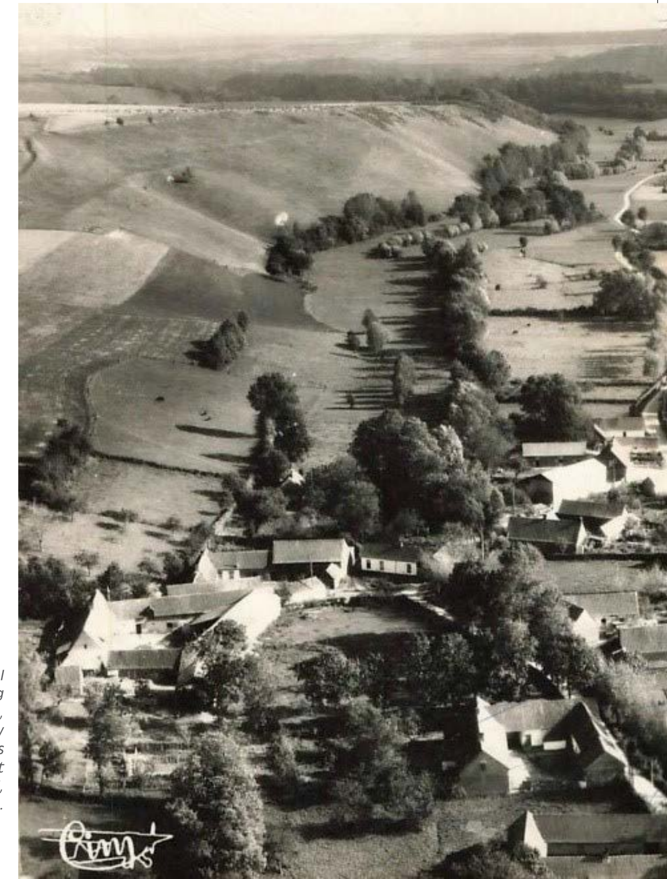
In this aerial view dating from the 1960s, we can see how bare the hills were at that time (postcard, coll. CHHP).

Impr. Desvres impression. 03 21 85 35 67. Textes et conception : Mathilde Duval et Sophie Léger. CHHP 2022.