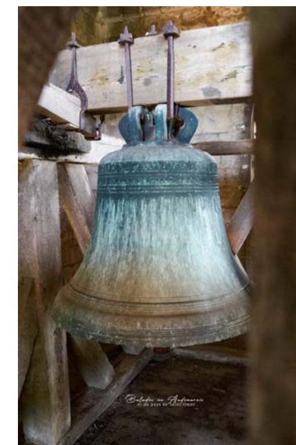
Guérardine in his belfry.