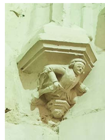
A sculpted cul-de-lampe in the centre nave.

From 1188 to February 1791 , when the monasteries were sold after the revolution, the monks of Saint-Bertin governed Acquin as its seigneurs. The fact that the church was dedicated to Pétronille, a name derived from "Pierrette", harking back to the time when the abbey church was dedicated to Saint Peter, shows just how long their rule was. The plain design of the church is typical of 15th century architecture. Its pointed windows and mouldings, with their profane cul-de-lampe carvings all relate to the Gothic style . Its buttresses show that it has a vaulted ceiling , a feature that is rare in this rural area. It is also built with noble materials such as chalk limestone, and slate for the roof. There are graffiti marks left on the walls by the stonemasons, wishing to immortalize their work. In the Saint Omer region, the church and fort of Acquin are considered to be the finest