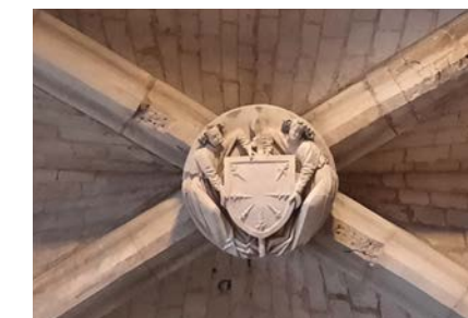
Listed keystones: coat of arms of Saint-Bertin (top); the Annunciation (bottom). Photographs by Mathilde Duval, coll. CHHP 2022).