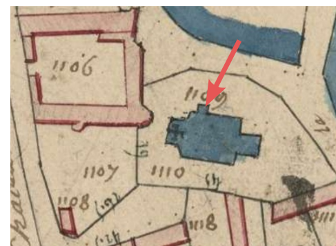
The side entrance to the church in 1824 (land registry plan, AD62, 3P 008/32).